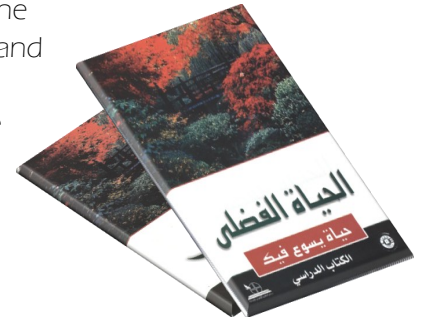
Arabic edition of "Abundant Life"

As we are striving to grow and expand in ways that fit our new strategic plan and make good use of the resources from our donors and supporters, we are working on a new projects for the PTEE. The Secondary Education Equivalent Diploma (SEED) offers adult learners and Arab Christian leaders a second chance to complete high school education in difficult places like Sudan where a large percentage of believers have not had the opportunity to do so. This loss of opportunity is often due to personal or economic hardship, or community instability resulting from war or natural disasters, or a combination of these factors. The need for an affordable diploma that will enhance reading, writing and communication skills, and emphasize church and community service while operating close to home, is great. Thus, PTEE is addressing this need by developing the twelve course SEED program that offers an alternative way of completing a ministry focused secondary education level diploma. Developing this program is going to cost us $365,000. Right now, we have raised about 50% of our first year's budget. We believe in the Lord's provision for us always, and we ask you to help us achieve this goal so we can reach out to adults in need.