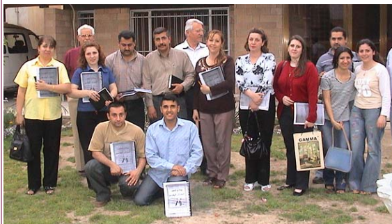
Class in 2006