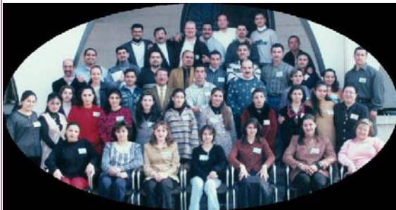
PTEE participants February 2002