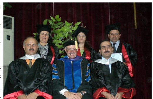
With graduating class in Syria

"I urged many people in my church to join the Program and study with the PTEE. Nine years later I graduated with a Bachelor of Theology (BTh) degree on 18th March, 2005, in Aleppo, Syria. Now there are two people who have graduated with an MA degree, four people with a BTh degree and many more who are studying with us and are looking to graduate soon.