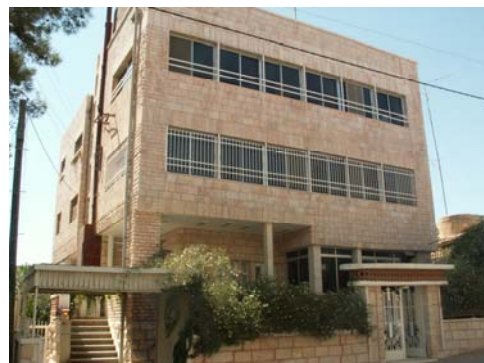
The PTEE Ministry Center in Jordan

A key to the continuation of the PTEE's work is the PTEE Ministry Center in Amman, Jordan. This is where we develop the courses, train many tutors, hold annual meetings, and coordinate the overall program administration. In addition to housing the PTEE's administrative offices, the building also serves as a resource center for local church leaders and theological students, and has guest accommodations for visitors to the program. We have the opportunity now to purchase this building and are actively seeking funds to cover the purchase price and the cost of renovations and improvements, the total of which is estimated to be $950,000.