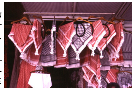
Traditional kefiyah in marketplace

This figure does not account for other time-intensive tasks like commuting and hidden costs like transportation to and from a class. For instance, to reach a remotely located Bedouin tribe who had invited PTEE to offer a course in northern Lebanon, one tutor commutes several hours per class session each week.