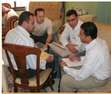
Tutors in tutor training

PTEE relies on tutors—men and women who serve as educational volunteers—to offer its Arabic-language courses to registered students across the Middle East, North Africa, and the global Arab Diaspora. These tutors, many of whom were once PTEE students themselves, are themselves trained in facilitation skills according to PTEE’s educational philosophy of learning as equals in community. Once trained, the tutors serve as PTEE’s commissioned professors in a virtual university whose reach extends far beyond a typical bricks-and-mortar residential university.